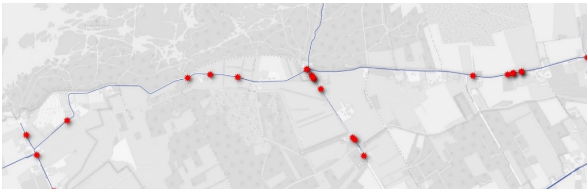
Figure 1. Water main with historic failures

Brabant Water is a Dutch drinking water utility company providing drinking water to 2.5 million inhabitants and 50,000 companies. The company has more than 18,000 kilometer of mains in order to transport 180 million m 3 of water per year. In order to meet performance requirements of the network, the company has the ambition to prevent a rise of the current number of failures in the aging network. Brabant Water has asked Spatial Insight to help identify water mains with the highest likelihood of failure based on asset and failure data.