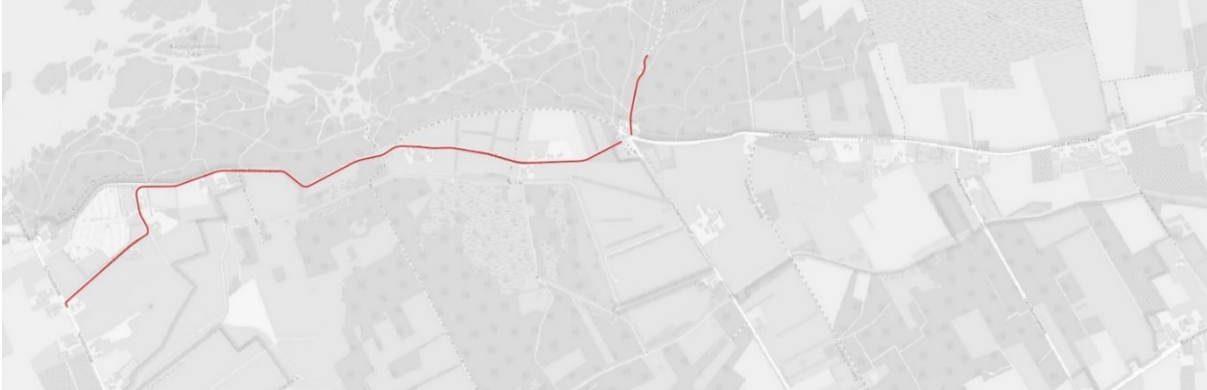
Figure 4. A selected cluster that contributes significantly to the total number of leakages.